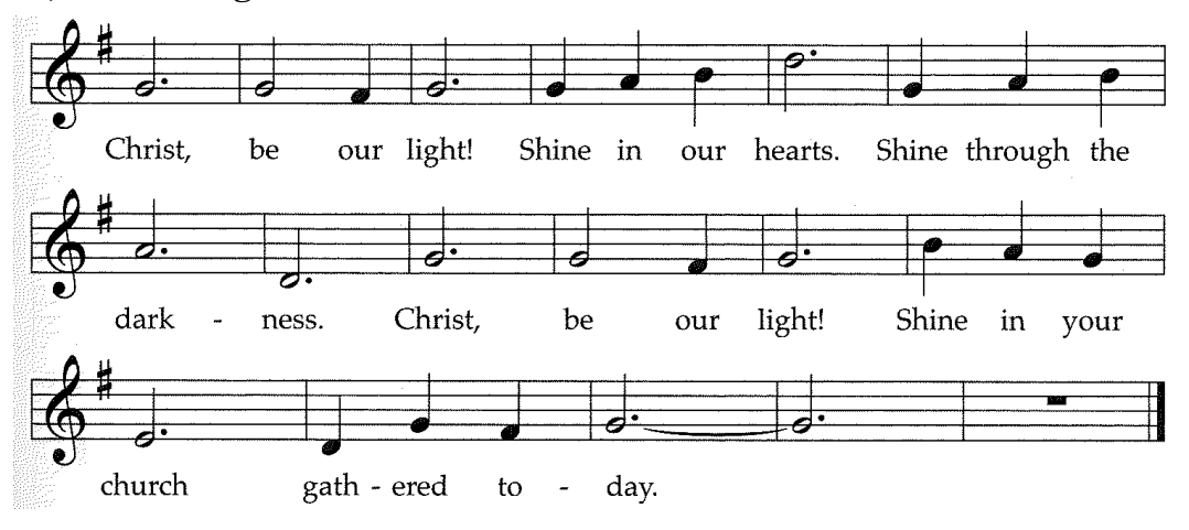
Christ, Be Our Light!