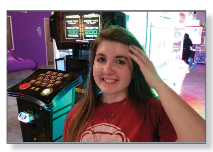
Brooklyn rocking the lanes