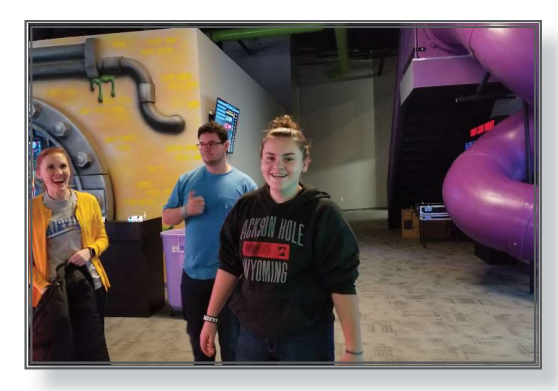
Thumbs up for Laser Tag VICTORY!