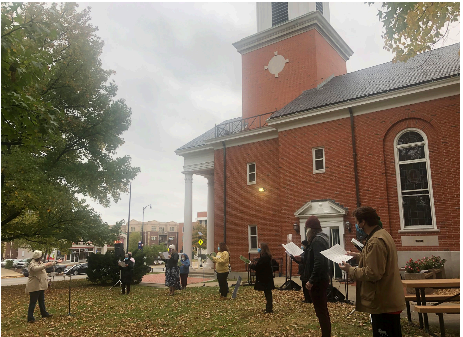
Chancel Choir members singing together on the front lawn.