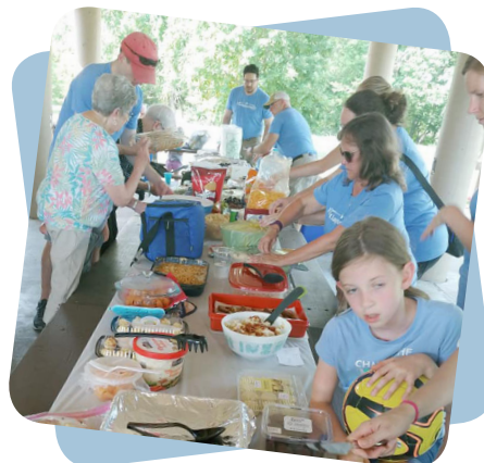
Wherever two or more of you are gathered in his name there is love, and usually food.