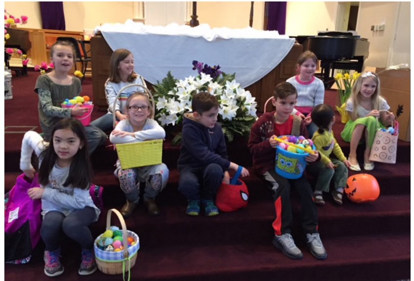
Above: Children rest in front of the altar to enjoy their Easter treasures.