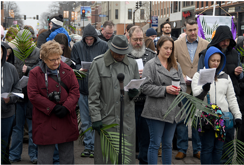
Above: First Baptist worshippers mingle with other downtown worshippers for a public celebration of Palm Sunday.