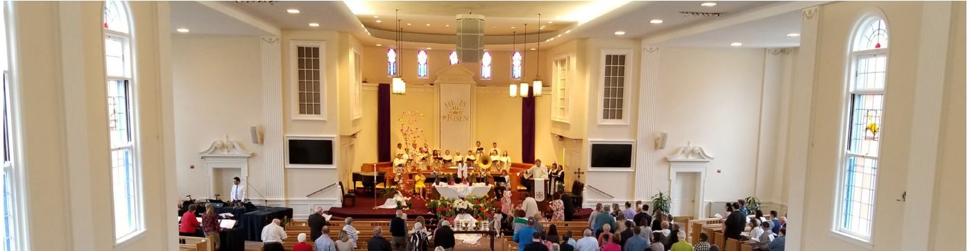
Above: Easter light glows in the Traditional Worship service.