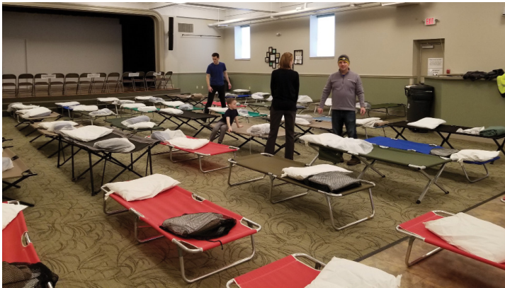
Volunteers preparing cots for the start of Room at the Inn at First Baptist