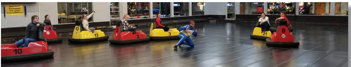
The First Baptist College/Young Adult group trying out Demolition Ball, which is a cross between bumper cars, lacrosse, and basketball!