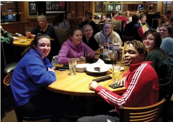
College/Young Adult group enjoying a meal together