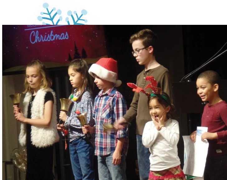
-Christmas Dinner 2018-