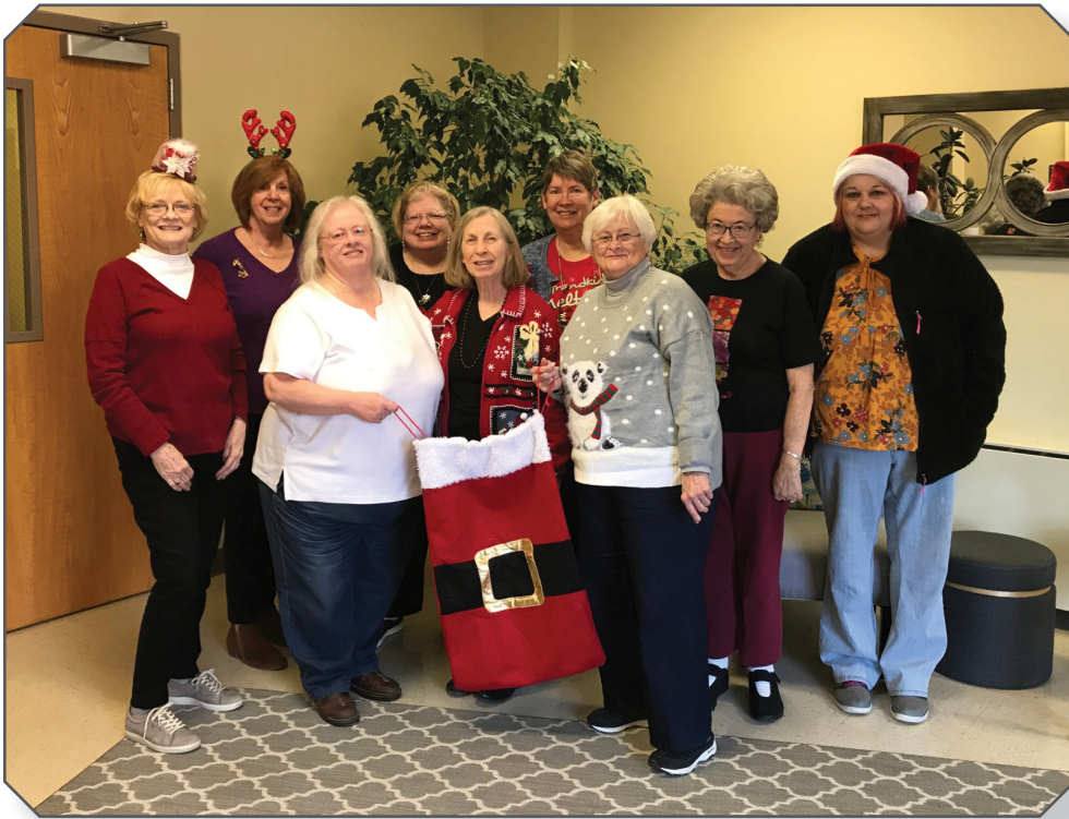
-Crafty Critters Christmas Party 2018-