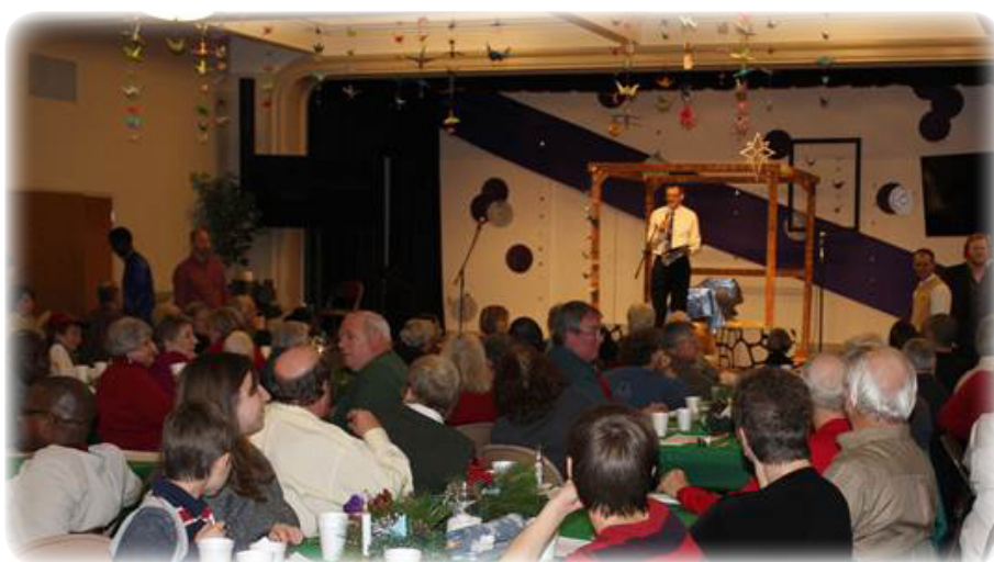
First Baptist celebrates the annual church Christmas dinner in 2015.

Sunday evening, December 10 from 5-8 pm is First Baptist's annual Christmas dinner. Come prepared for a lovely meal with turkey, ham, and beverages provided by the church, and wonderful side dishes and desserts prepared by you and your First Baptist friends.