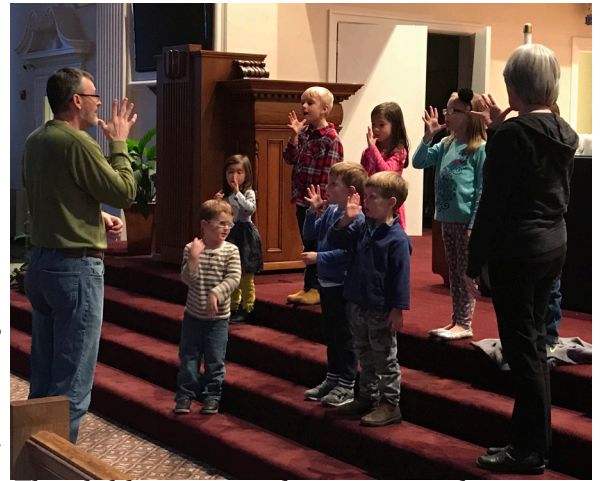
The children are not learning sign language for “nanny nanny boo boo,” but the sign for “mother.” You’ll see it used as they sing “Silent Night.”

The 2nd Extra Fun Bonus Rehearsal will happen on Saturday, December 9 and we’ll provide more information about that.