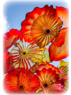
An example of Chihuly art

On Friday-Saturday, October 6th-7th, we will take an overnight trip to Bentonville, Arkansas to visit Crystal Bridges Museum of American Art. Permanent exhibits are free for viewers, but at the time we are going there will be a special exhibit of Chihuly artwork, for which there is a $10 entrance fee. The trip will also include a stop at the Top of the Rock museum in Branson. Final cost will be determined when we get a head count.