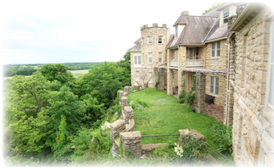
A view of Bothwell Castle