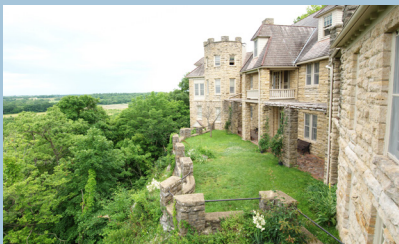
A view of Bothwell Castle