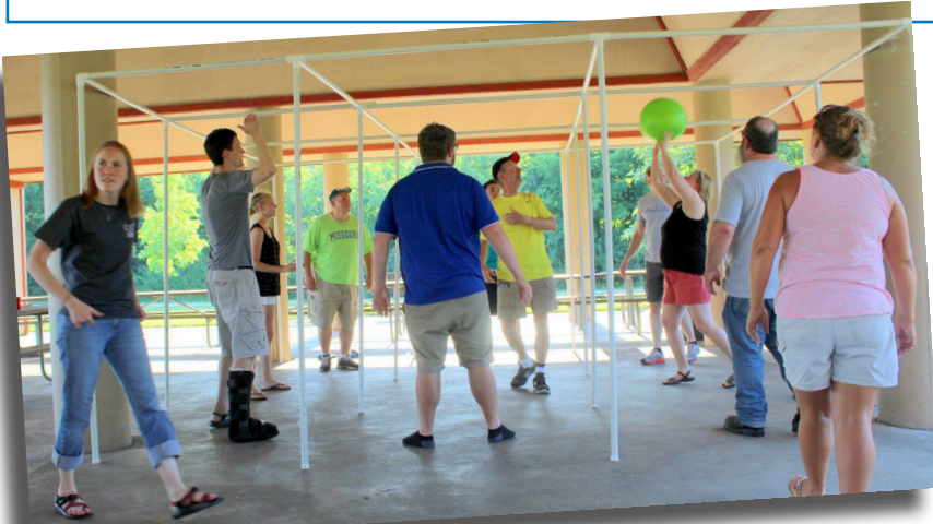
Left: last year's picnickers enjoy a game of 9-Square.