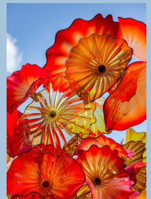
An example of Chihuly art