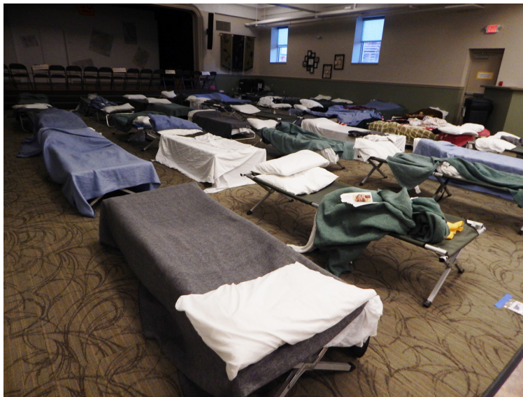
Above: the Fellowship Hall is transformed into a safe, warm place for the homeless to spend the night.

In addition to hands-on help, donations are a critical part of RATI operations and your generous gifts of both goods and money will have great impact. Checks can be made out to the "Columbia Interfaith Resource Center" with a note/memo for "Room At The Inn Columbia" and can be giving through the church or sent to the following address: Columbia Interfaith Resource Center, ATTN: RATI Donations, P.O. Box 272, Columbia, MO 65205.